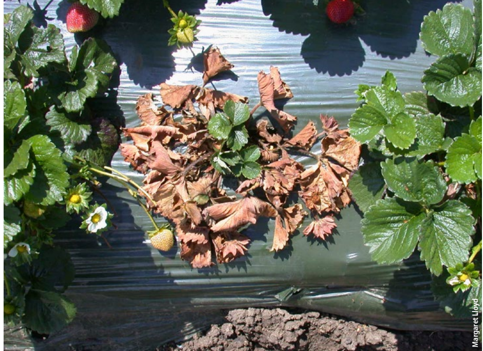
A strawberry plant affected by Verticillium wilt.