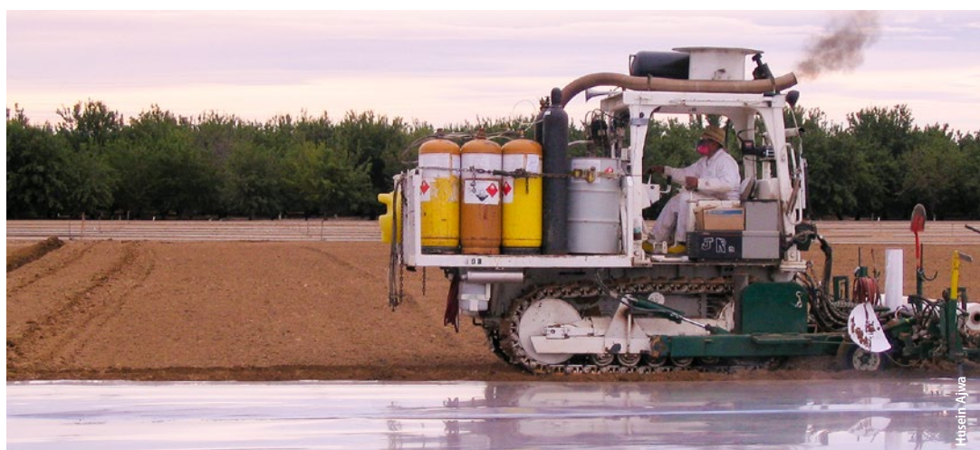
Tarping fields helps to retain fumigants in soil.

Incomplete mortality of V. dahliae (60% to 80%) was observed with all tested