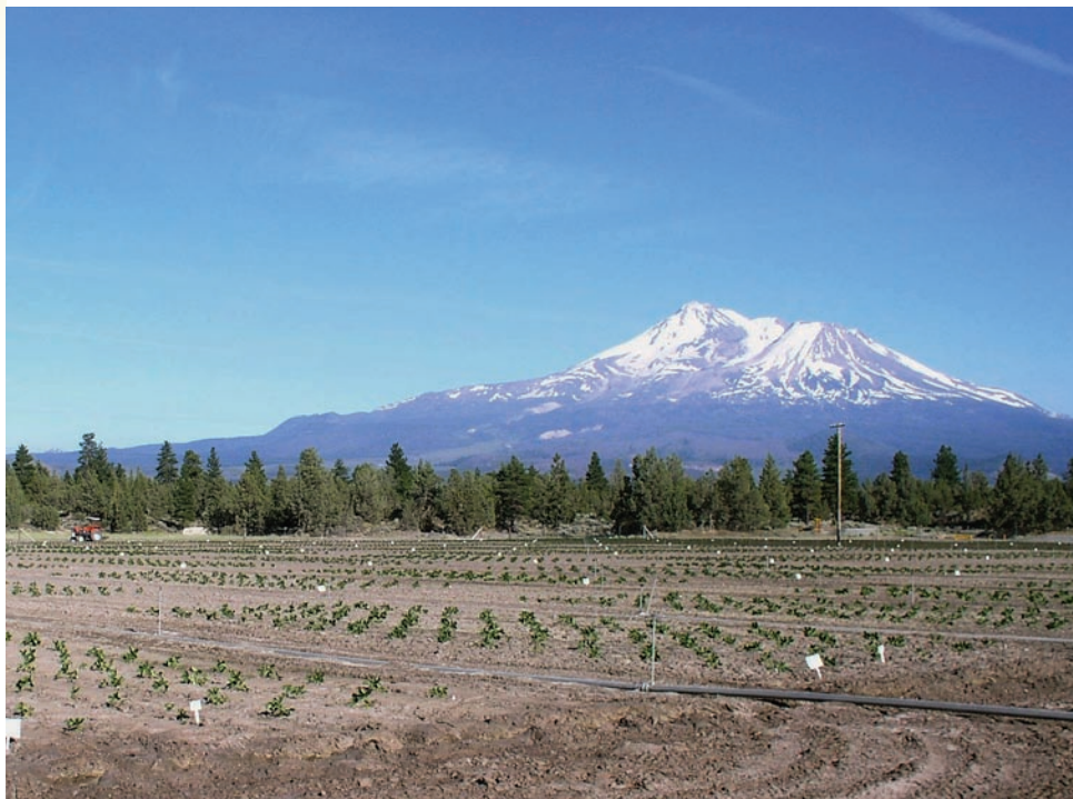
California strawberry runner plants are propagated in high-elevation nurseries such as this one near Macdoel, north of Mt. Shasta. The harvested runner plants are transported to fruiting fields in California or exported to other states or countries.

Methyl bromide (MB) is a fumigant that is applied to the soil before planting to provide season-long control of soilborne pathogens, insects, nematodes and weeds. Several vegetable, fruit and perennial crops rely on methyl bromide for pest control (USDA ERS 2000). In the United States, tomatoes, strawberries and peppers account for most of the methyl bromide used in soil fumigation (30%, 19% and 14%, respectively) (Carpenter et al. 2000). Other crops that use methyl bromide include almonds,