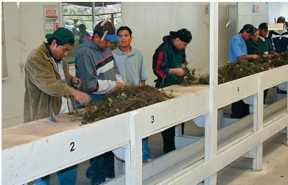
At Lassen Canyon's trim shed in Redding, workers sort strawberry plants harvested the previous day from high-elevation nursery fields. The workers separate healthy, marketable plants, trim them and then pack them for shipment to fruiting fields on the California coast.

At Macdoel, the treatments evaluated were: (1) equal amounts of iodomethane and chloropicrin at 350 pounds per acre; (2) methyl bromide plus chloropicrin at 400 pounds per acre (57% MB + 43% CP); (3) chloropi-