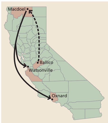
Fig. 1. Nursery production evaluations were conducted at a low-elevation site at Ballico. Harvested runner plants were then transported to Macdoel for use in the high-elevation experiment. Fruit evaluations were conducted on the coast at Watsonville and Oxnard.

ducted in strawberry nursery and fruit production systems to evaluate the effects of alternative fumigants on disease, nematode and weed control. We monitored the movement of plants through the system, allowing inferences to be made about the cumulative effects of fumigation. In addition, we gathered and evaluated information on the economics of production for each treatment. To our knowledge iodomethane has never before been evaluated in California strawberry nurseries. More detailed methods and results are published elsewhere (Kabir et al. 2005).